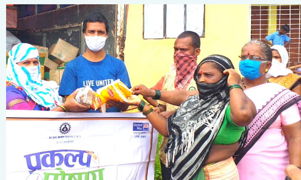
Field team distributing the ration kits to the families of undernourished children in Karjat

484 ration kits were distributed among the families of 510 undernourished children in 11 tribal villages of Karjat. Most people in these villages are daily wage earners and work at brick kilns of nearby villages, which ceased worked during the lockdown forcing most of the people to return to their villages. This caused a worsening of the health of undernourished children during the current pandemic.