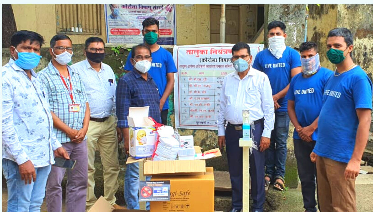
Health safety kits handed over to Taluka Health Officer, Karjat